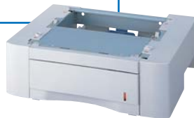
550-sheet 2nd Paper Feed Module DA-DS188