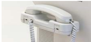
Handset Kit UE-403171