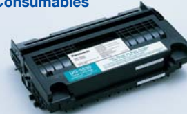
Toner cartridge UG-5530