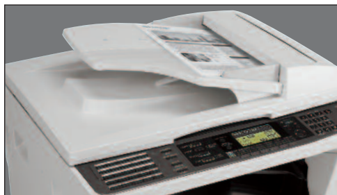
MX-M200D shown with standard 40-sheet Reversing Single Pass Feeder.